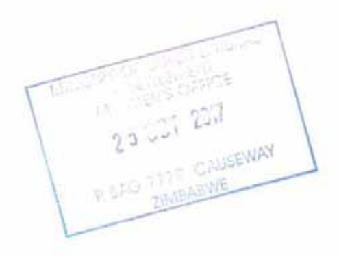
Hon. Dr. D.T. Mombeshora; MP Minister of Lands and Rural Resettlement