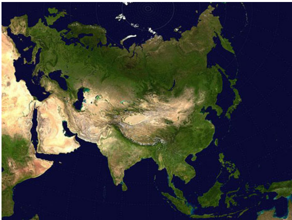
A satellite image homing in on Eurasia (based on an image from NASA's Blue Marble project).

The need to change this paradigm is not just a result of the anniversary of the Soviet Union's collapse. It also stems from the fact that in recent years, all these processes have rapidly accelerated. In 2013 it became clear that the existing post-Soviet model of economic, social and political development was entering into decline. It was then that the current economic crisis affecting Russia, which hit the former colonies, began. In November 2013 Ukrainians started their Revolution of Dignity in Kyiv. These events later developed according to Hitchcock's rule: "A good film should start with an earthquake and be followed by rising tension." There is no doubt that the protests that took place in Kyiv between 2013–2014 caused Ukrainians to turn towards the EU and thus led to Russia's aggression in Ukraine. Russia, in conflict with the West, decisively approached China, which further worsened the conditions that the more powerful Beijing decided to dictate. The system of communicating vessels deepened. Increased Chinese influence in Russia translated into China strengthening its position in the whole post-Soviet space, particularly Central Asia. The stronger China's position in Russia's neighbourhood is, the greater its field of manoeuvre towards Moscow.