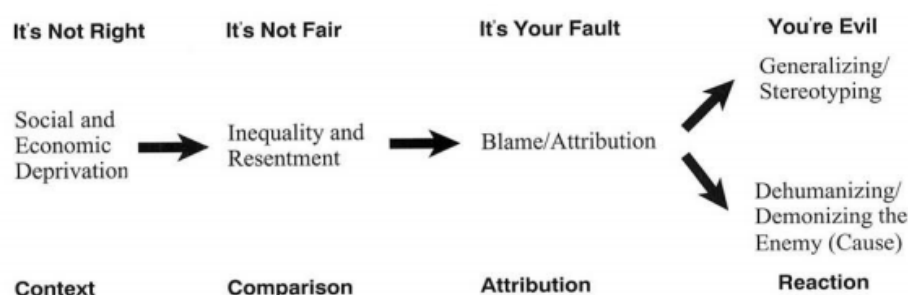
Figure 2: Borum's Four-Stage Model for the Process of Ideological Development 39

The New York Police Department's Intelligence Division developed a linear four-stage model (see figure 3) to explain an individual embracing a radical ideology and acting upon it violently. The process begins in the pre-radicalisation stage, whereby an individual is exposed to Jihadi-Salafi ideology. This is followed by a 'self-identification' stage during which an individual closely examines Salafi Islam and its ideological principles. During the indoctrination phase, the individual's beliefs intensify and she/he surrounds herself/himself only with like-minded individuals. In the last 'Jihadisation' phase, the individual fully accepts Salafi Islam as a radical ideology and acts upon it. 40