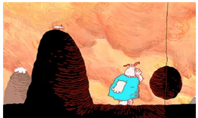
2D or not 2D