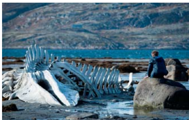
Leviathan by Andrey Zvyagintsev