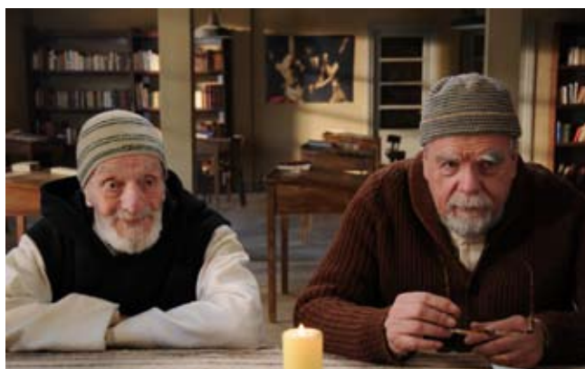
Of Gods and Men by Xavier Beauvois