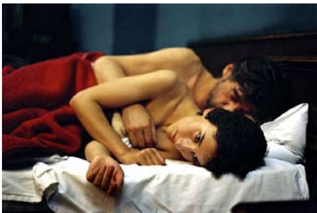
Head On by Fatih Akin

Wednesday 27 January - 10 am - Centre de Congrès, Salle GAN